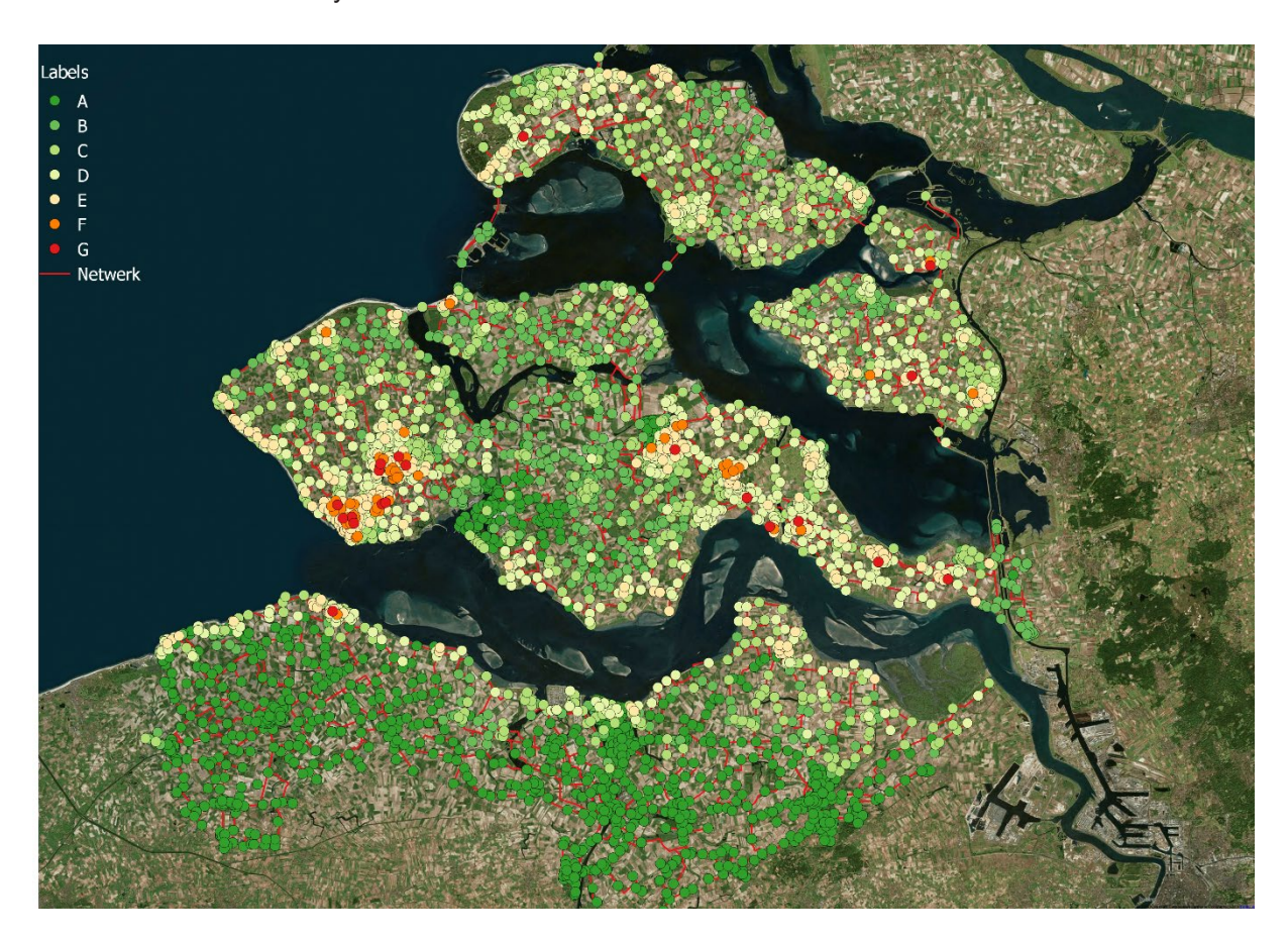
FIG. 2: Provisional risk labels for all medium-voltage and high-voltage substations and switching stations in Zeeland. The points counting for the labels still needs to be finalized.

The aim of the risk label is to make clear for the various bodies who have to limit the consequences of a flood which substations and switching stations are vulnerable to floods and which are not. In addition, the label also helps give a picture of what the best measures are for limiting the damage and the consequences. All the high-voltage stations and more than 3,800 medium-voltage stations have been included in the analysis.