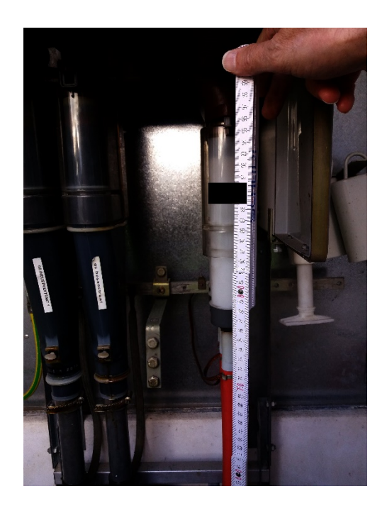
FIG. 3 Critical height of a switching station

A distinction is made between direct and indirect failure. The repair work for indirect failures is easier because the object itself has not been flooded. Switching stations or substations that fail directly therefore get a poorer label.