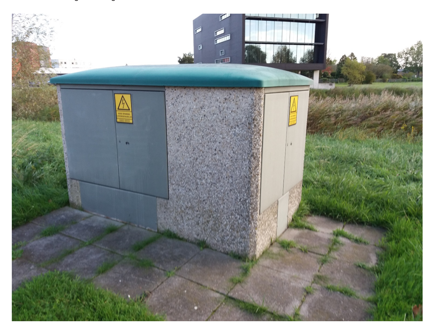
FIG. 1 Substation

In the first instance, risk labels have been determined for about 3,800 substations and switching stations on the electricity grid. The risk label indicates how 'vulnerable' the station is. The measures that could be taken to strengthen it were then examined. These could for instance involve smarter choices of the locations for crucial switching stations or substations, extra protection, configuring systems inside switching stations or substations so that they are physically raised, as well as diversions in the grid routing or additional connections.