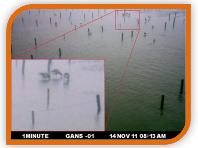
10. Geese feeding on seagrass in a transplant.

There even seems to be an extra interest in the areas around the poles, as there is some collection of seaweed around the poles, which creates a niche for macrofauna, upon which the birds feed. The birds seen at the transplant location are the generalist mudflat bird species such as stilts and oystercatchers, although on occasion a crow or (unidentified) bird of prey was observed as well.