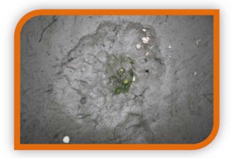
2. A geese feeding pit

these pits are susceptible to erosion processes, while