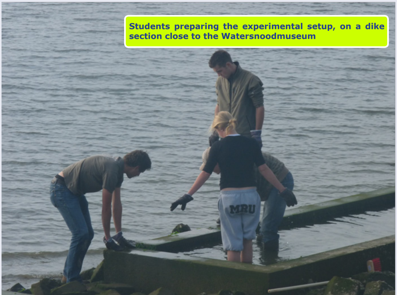
Students preparing the experimental setup, on a dike section close to the Watersnoodmuseum