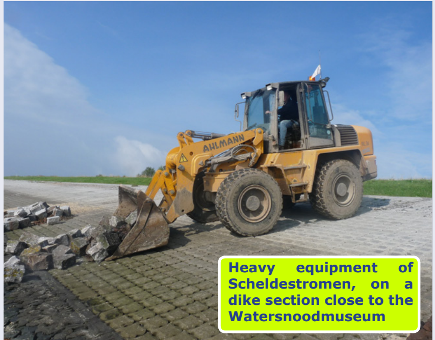
Heavy equipment of Scheldestromen, on a dike section close to the Watersnoodmuseum

Near the Watersnoodmuseum at Ouwerkerk, Waterschap Zeeuwse Stromen has placed 9 "bath tubs" (2x4m) near the dike, on the intertidal zone. during flood, the bath tubs will fill with water from the Oosterschelde. The bath tubs are ideally set up to execute experiments to investigate the Rich Revetment (Rijke Dijk) concepts. In autumn of 2010 each bath tub has been filled with a selection of materials used for dike protection, such as concrete, basalt, granite and limestone. SETL plates have been added. The goal of the experiment is to analyze the influence of material type and sorting on biodiversity and species abundance.